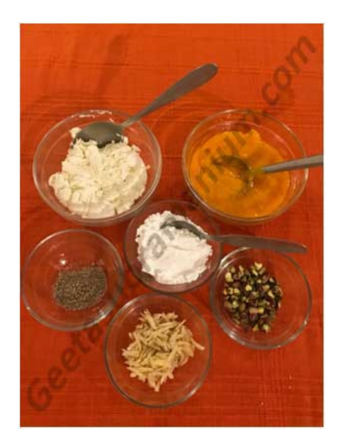
10. Collect all the ingredients together. In afresh bowl add 1 tbspof curd and 1 tbsp sugar. Mix well with a fork. Do not use an egg whisk . Keep adding the curd and sugar alternately and keep mixing.