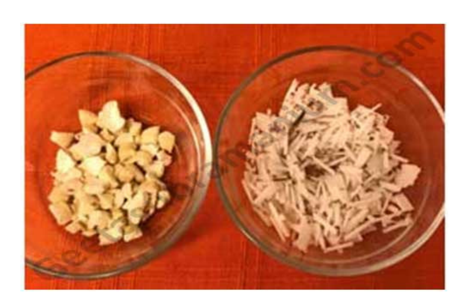
11. In a wok heat 1 tbsp ghee and fry the nuts and the finely chopped coconut and transfer into the kheer.